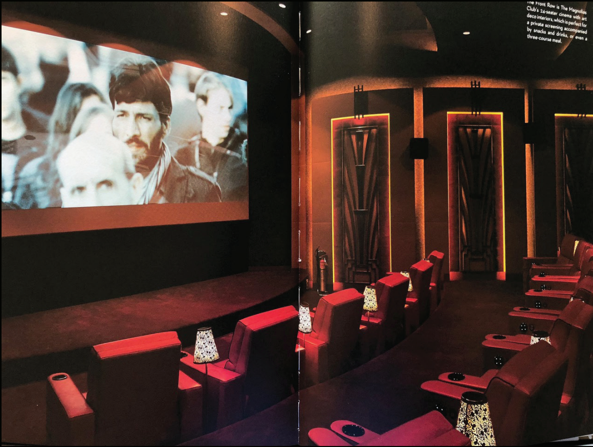
The front row in The Magnolias Club is 24-seater cinema with art deco interiors, which is perfect for a private screening accompanied by snacks and drinks, or even a three-course meal.