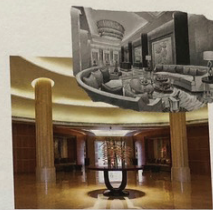
THE MAGNOLIAS CLUB'S MAIN LOBBY